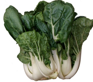
Baby Buk Choy