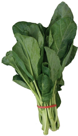
Gai Lan (Chinese Broccoli)