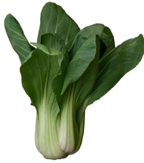
Pak Choy or Baby Pak Choy