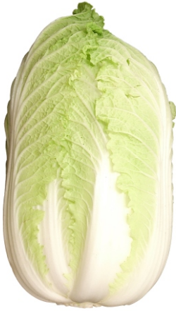
Wombok (Chinese Cabbage)