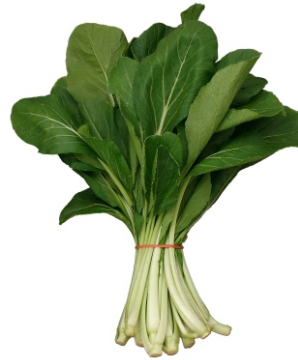
Baby Choy Sum